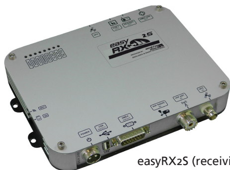
easyRX2S (receiving unit)

As a receiver, you need to have the Weatherdock AIS receiver easyRX2S which is tunable to the special customized VHF frequencies used for the marking and locating.