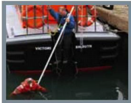
Survivor is then moved to best position for recovery