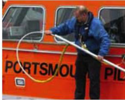
Crewmember standing by with full loop