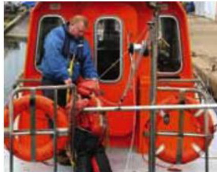
Survivor recovered aboard