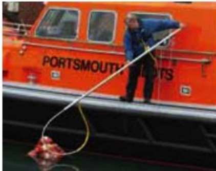
Loop pass; conscious over head unconscious under feet